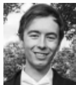
WILLIAM SEYMOUR KELLOGG